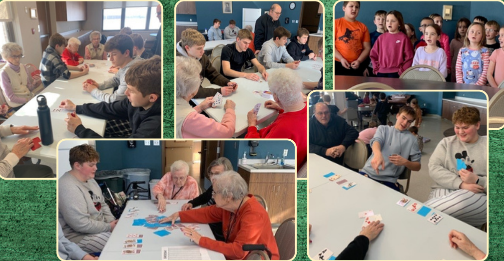
During Catholic Schools Week, students from St. Mary's stopped by to play games with the Lake Villa Maria residents, as well as sing songs for them!