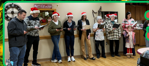
Carolers from the Sleepy Eye Medical Center stopped by to help "Deck the Halls" with their musical talents!