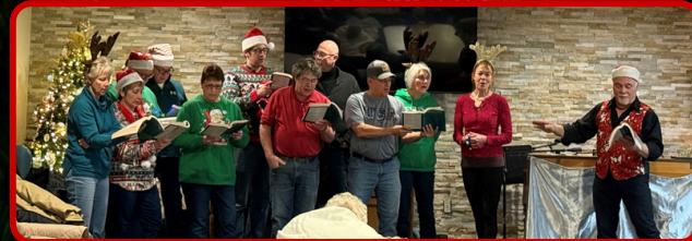
The Ministers of Music from St. John the Baptist Church of Searles helped bring some "Joy to the World"!