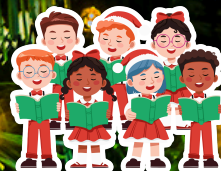
"O Holy Night"... The Concord Singers filled the evening with beautiful songs and stayed to visit with the grandfriends too!