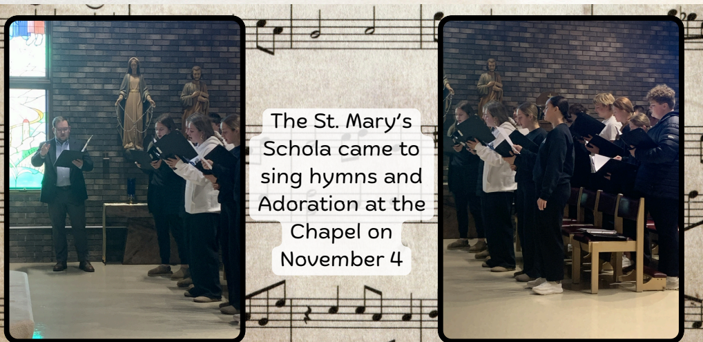
The St. Mary's Schola came to sing hymns and Adoration at the Chapel on November 4