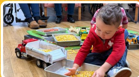
Playing with Corn