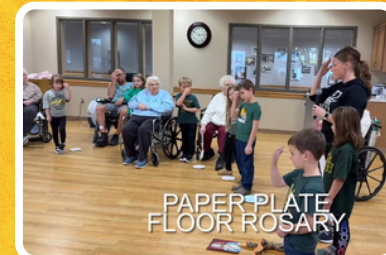
PAPER-PLATE FLOOR ROSARY