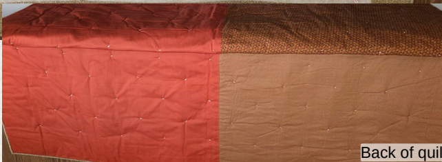
Back of quilt

There is a variety of rustic colors with a little splash of coral mixed in. Little green leaves over a gold background make up the border. The back showcases some beautiful rust colors including burnt orange and an autumn brown. This beautiful quilt handmade by the Auxiliary Ladies costs $275.00. This quilt would be the perfect addition to your bedroom this fall season- stop in to Divine to take this quilt home today or visit the website at divineprovidencehome.org to see the entire listing of quilts.