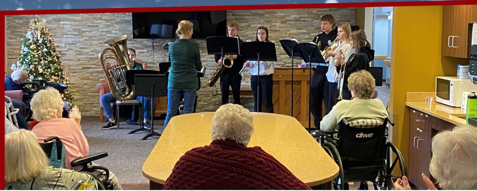
A group of St. Mary's Students entertained the residents performing Christmas Carols