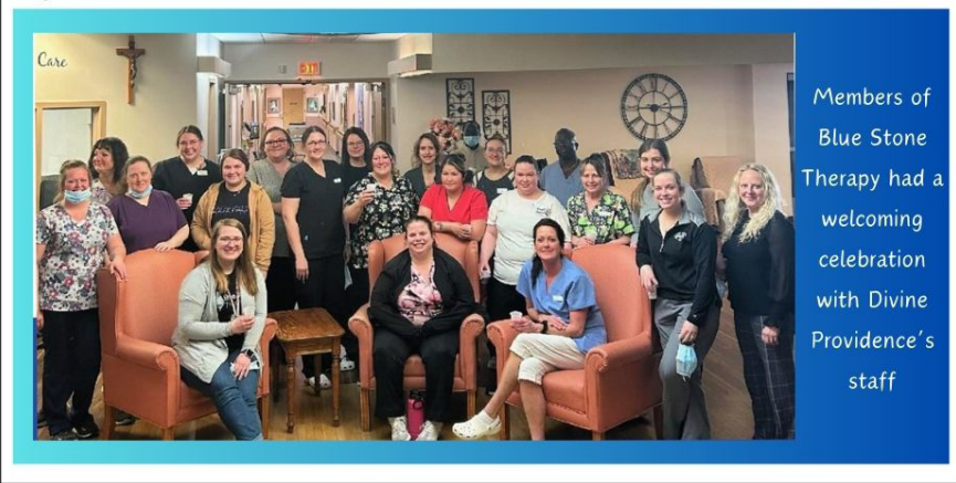
Members of Blue Stone Therapy had a welcoming celebration with Divine Providence's staff

Our goal is to continue providing an enriching program of services that cater to the needs of our residents and develop their capabilities and wholeness of life. We believe that our change in rehabilitation services will increase patient satisfaction and positive outcomes. We are committed to providing a holistic continuum of care that caters to the physical, emotional, and spiritual needs of each resident. We look forward to serving you better with our new and improved rehabilitation services.