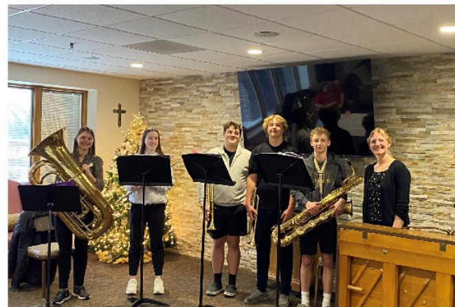
St. Mary's Ensemble spreads Christmas Cheer and shares their talent in the living room.