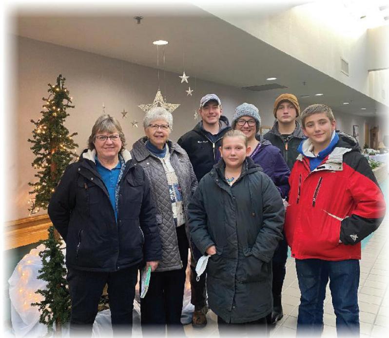
Above: Faith United Methodist carolers spreading Christmas cheer