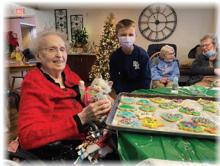
St. Mary's Second Graders frosted cookies for us!