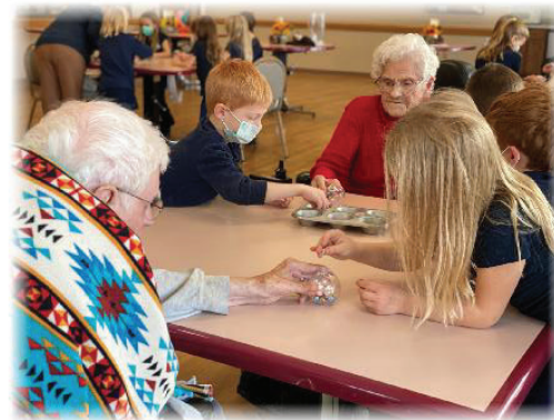
St. Mary's Kindergarten Class creating I Spy Ornaments with our Grandfriends

Thanks for your cooperation and understanding.