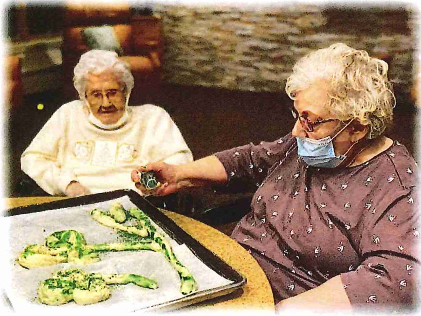
Making Shamrock Snack Treats