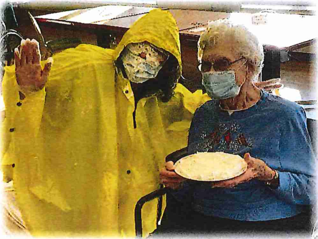
Going bananas on National Banana Pie Day!