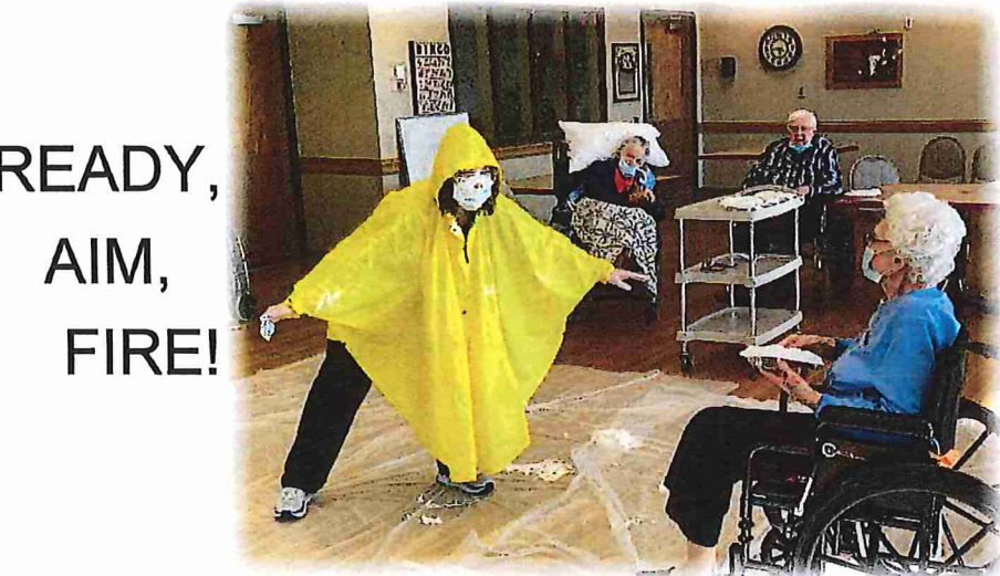
READY, AIM, FIRE!